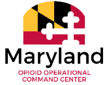
Exhibit 1 Grant Agreement

STATE OF MARYLAND MARYLAND DEPARTMENT OF HEALTH Opioid Operational Command Center 100 Community Place, 4 th Floor • Crownsville, Maryland 21032